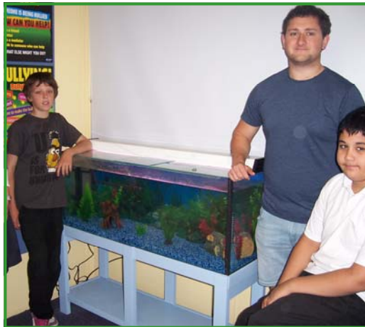
The restored fish tank

During Term 3 students in the RTSC restored a fish tank that was donated to the centre. Students were involved in wood work lessons to restore the broken stand as well as cleaning and resealing the tank. Once the tank and stand were ready, students went on an excursion to the local aquarium to purchase supplies and fish for the tank.